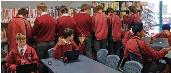
Year 11 Students searching the library

The aim of the initiative was to get acquainted with the school's collection of fiction and non-fiction and, of course, to attract very rare library users.